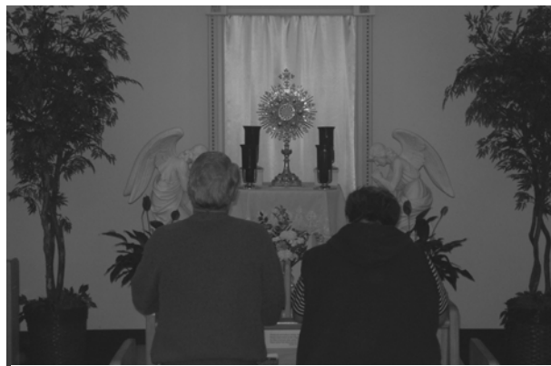
Adorers at Perpetual Adoration Chapel at SS. Peter & Paul in Green Bay

You may wish to put information in your bulletin regarding the Perpetual Adoration Chapel in your area. Contact the parish at which it is located: Appleton St. Pius, Chilton Good Shepherd, Green Bay SS. Peter & Paul, Marinette Holy Family, and Neenah St. Margaret Mary.